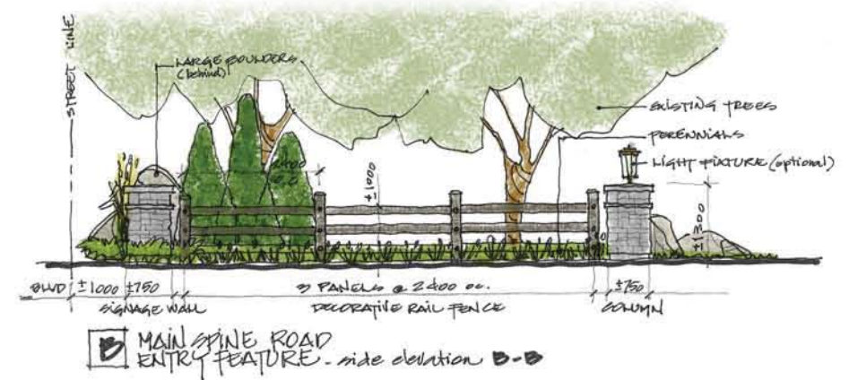
B MAIN SPINE ROAD ENTRY FEATURE - side elevation B-B