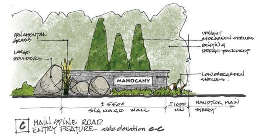
C MAIN SPINE ROAD ENTRY FEATURE - side elevation C-C

PRIVACY or ACOUSTIC WOOD FENCE IN COMBINATION W/ TALL MASONRY COLUMNS